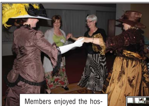
Members enjoyed the hospitality of IODE Nova Scotia at Friday evening's theme night, The Order of Good Time , with dancing, singing and an opportunity to mingle with friends from across the country.