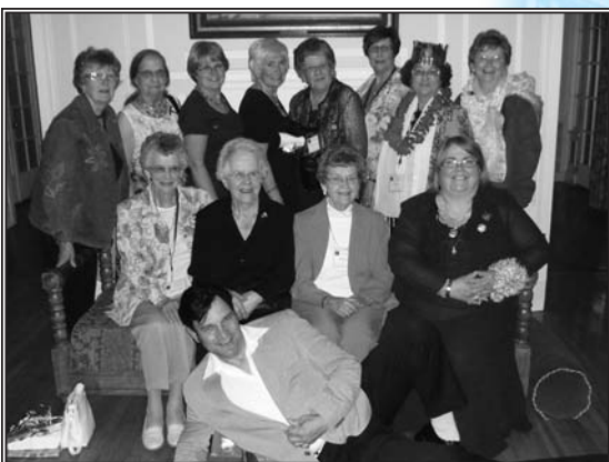
PEI members with "Elvis".