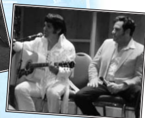
Two Elvises in the hotel!