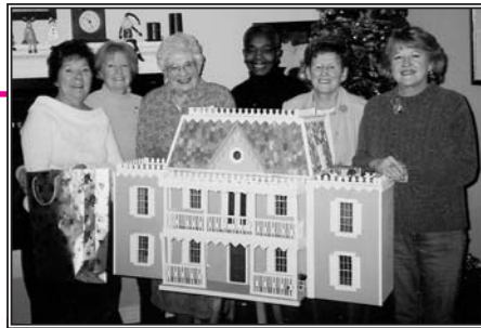
Doll House raffle raises $1,200 for camperships. Members of IODE Bishop Hellmuth Chapter , London, ON, will be able to assist needy children to attend camp. Smiles, self-esteem and life experiences will be a further reward.

• IODE Boundary Bay Chapter , Delta, BC, supports South Delta Secondary School with two programs not covered by regular school funding. The Textile Fashion Club, open at lunch time, provides a place to be creative. Students design and sell costumes, gifts and dresses. They donated a quilt to charity. The chapter also supports the Alternate Café which coordinates with the School Food Courses and feeds lunch to 30 to 50 students daily. Students are responsi-