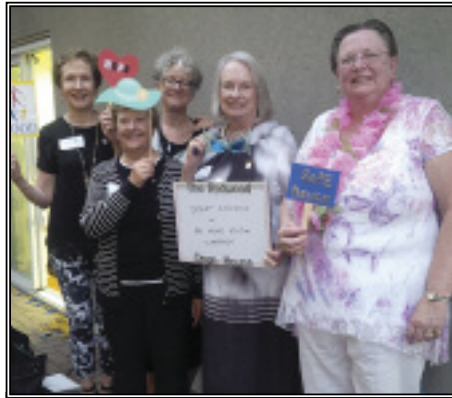
Attending an open house at The Redwood, Toronto, ON. This women's shelter was a recent recipient of an IODE 100 th Anniversary Grant.

New Governor General Julie Payette has been invited to accept the role as our Honorary President. A congratulatory letter has been sent to Her Majesty and Prince Phillip on the occasion of their 70 th Wedding Anniversary. A letter was also sent to extend heartiest congratulations to Her Majesty Queen Elizabeth II and His Royal Highness on the engagements of their grandson Prince Harry and Meghan Markle and their granddaughter Her Royal Highness Princess Eugenie of York and Mr.