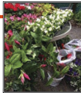
IODE Kathleen Drope spring flower sale.

young adults are the recipients of bursaries and scholarships to ensure they are able to continue their studies. IODE Ontario also recognizes the military, first responders and those providing outstanding service in the community.