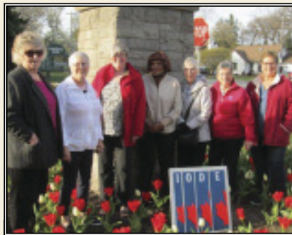
IODE Sarnia-Lambton Municipal , Sarnia, ON, celebrates Canada's 150 th with a donation of tulips to the city of Sarnia.

During WW II, all overseas parcels and books for camp libraries which were handled by the National Chapter, were packed at a large packing room at Provincial Headquarters by Hamilton members. This partnership between IODE Canada and IODE Ontario remains. The packing room functions today as it always has, but now in a different location. During 2017, over 127 parcels packed by IODE members were sent to twelve locations in Labrador, five in Nunavut and one in Manitoba with shipping costs paid by the National Services Fund. Nursing stations, schools and community centres in remote northern locations are served.