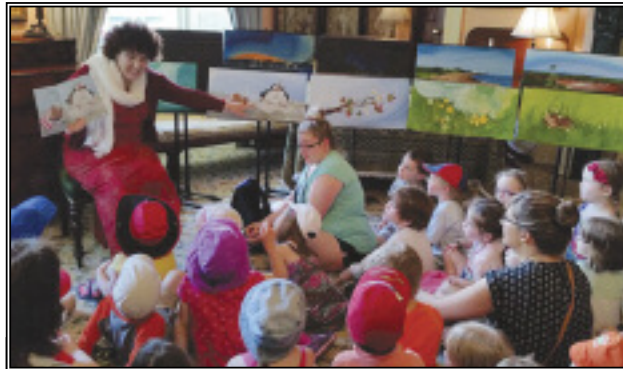
Another book in the Born to Read New Brunswick program launched at Fredericton's Government House.