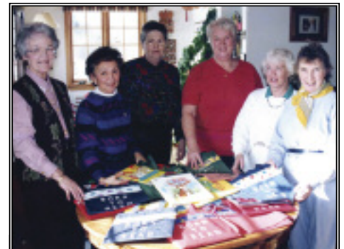
A group of Fredericton area women with their freshly made Born to Read bags.

In 2017, BTRNB Inc. commemorated 20 years as a provincial program. IODE celebrated with all the amazing partners that have made and continue to make this program such a success story. Since its inception, Born to Read has seen over 108,000 'little red bags' delivered into the hands of New Brunswick newborn children and families, working to improve their quality of life.