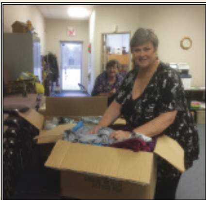
Packing toys for the North at the Provincial Packing Room.

piece of child welfare in partnership with the Canadian Pacific Railway when a Pullman car was renovated for living quarters for a dentist and his wife. It toured northern Ontario rail lines and provided children with free dental work covered by the Ontario Health Department.