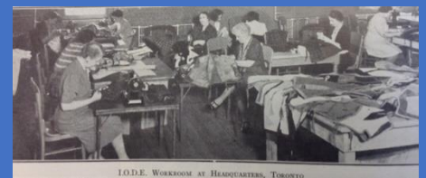
IO.D.E. WORKROOM AT HEADQUARTERS, TORONTO