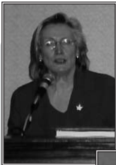
Dr Carolyn Bennett