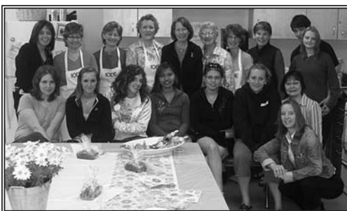
Richmond Chapter , Richmond, BC, hosted a Mother's Day Brunch for the Colts Young Parent and Transitions Program at Richmond High School. The IODE members can be seen wearing white IODE aprons.