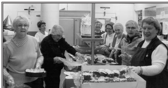
The chapters of IODE Calgary Municipal served lunch for clients of the Calgary Drop-in Center. Members baked, decorated and served 800 cupcakes.