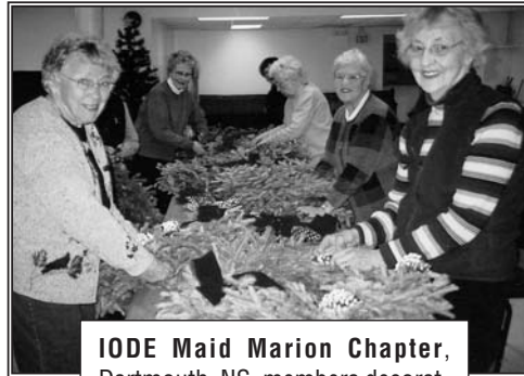
IODE Maid Marion Chapter , Dartmouth, NS, members decorating wreaths for a Christmas Sale.